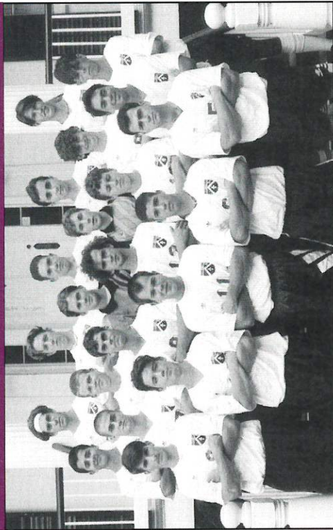
THE 1994-95 MEN'S SOCCER TEAM