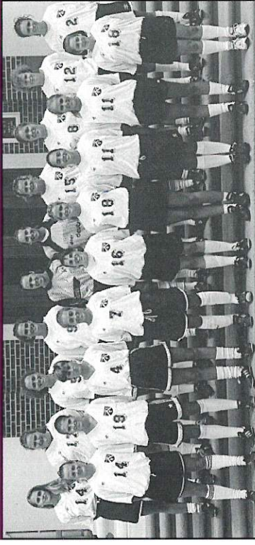
THE 1994-95 WOMEN'S SOCCER TEAM